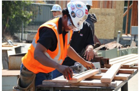
Workers on job site

City and County of San Francisco (City of SF) is a joint powers entity governed by the City Mayor and County Board of Supervisors. The City of SF's Office of Economic and Workforce Development (OEWD) operates Workforce Innovation and Opportunity Act (WIOA) programs in San Francisco. OEWD also supports Workforce Investment San Francisco.