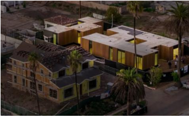
City of Pacific Palisades, the neighborhood and project site for the Labella family home. Used with permission of Cover Technologies, Inc. Credit: Cover Technologies, Inc.